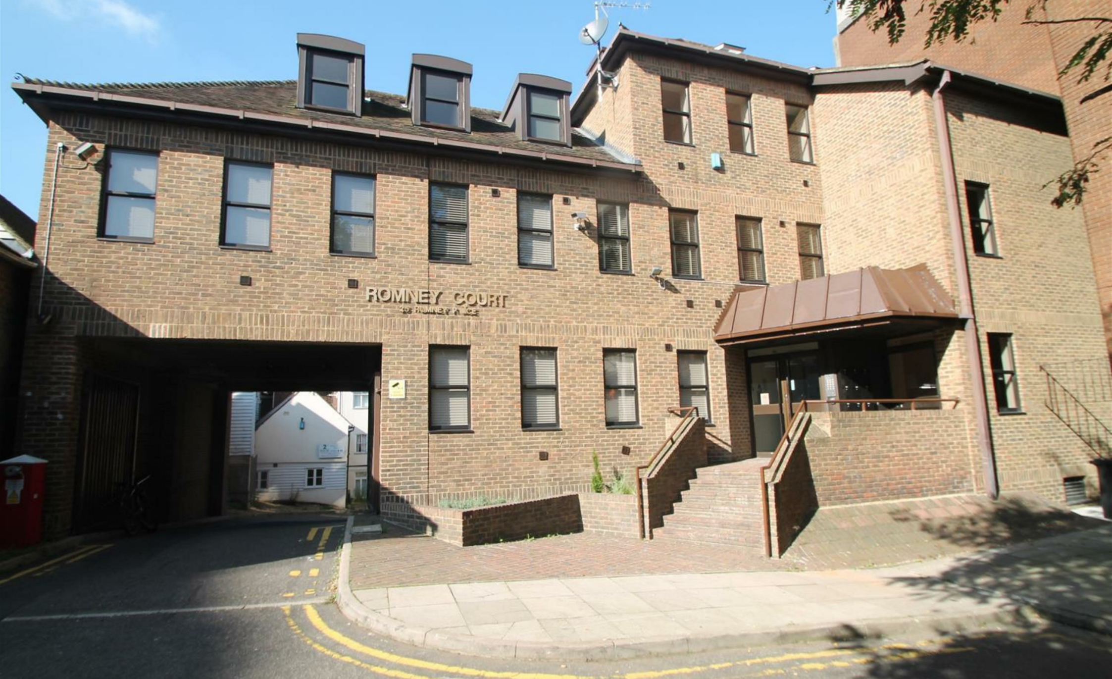
12 Romney Court, Romney Place, Maidstone, ME15 6LG £1,200 PCM